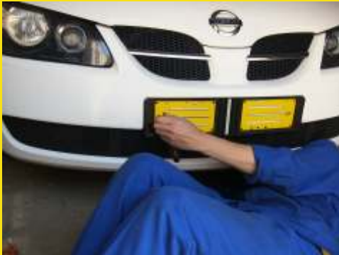
M6 bolt being used to secure the attachment frame to the bumper or body of the vehicle

Avoid costly fines, get your number plates fitted by an approved fitment centre. Contact your number plate supplier for advice.