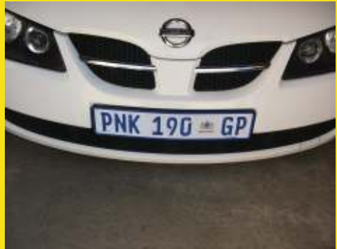
The number plate is fixed to the vehicle legally