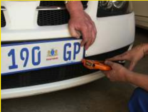
Number plate being riveted to the attachment frame using 4 x 6mm rivets